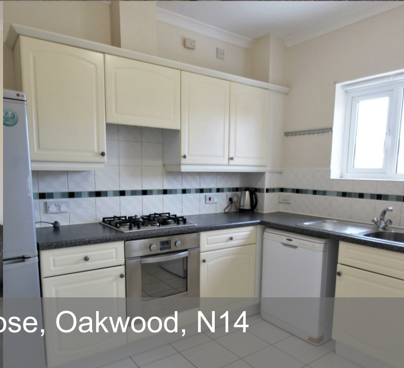
Woodville Court, Stafford Close, Oakwood, N14